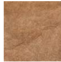
AF3R Burgundy TC 20"x20"