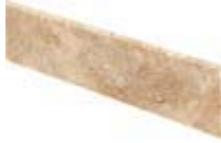
AF3S Burgundy GR SBN 3"x13"