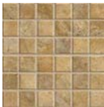
AG59 Burgundy GO Mosaic Square 13"x13"