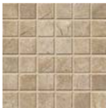
AG58 Burgundy GR Mosaic Square 13"x13"