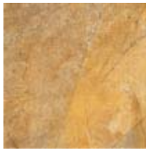
AF3P Burgundy GO 20"x20"