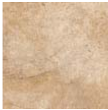
AF3N Burgundy GR 20"x20"