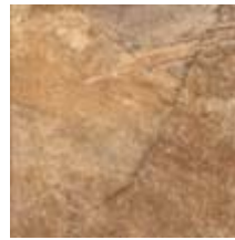
AF3O Burgundy NO 20"x20"