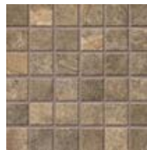
AG6A Burgundy NO Mosaic Square 13"x13"